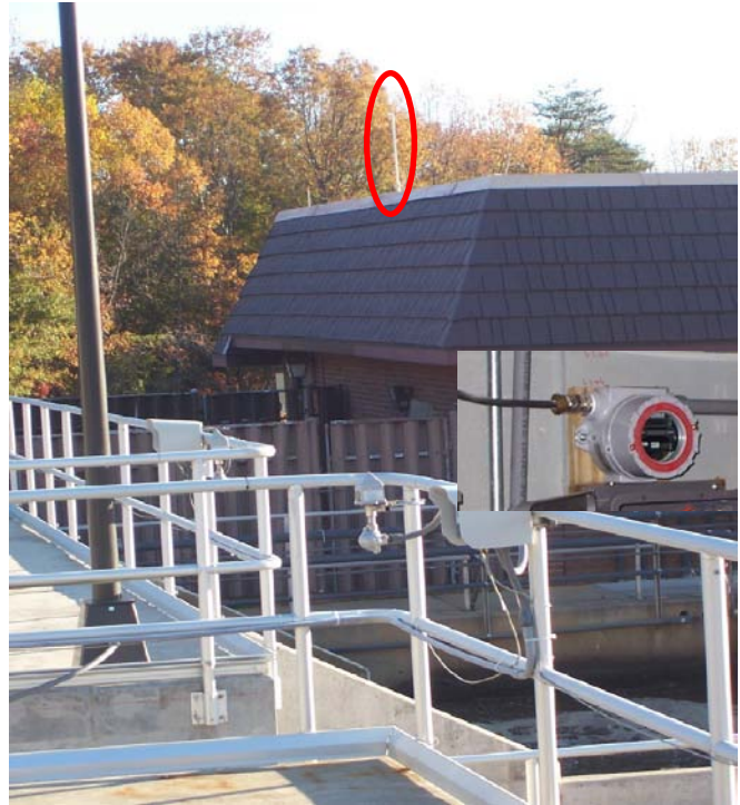
Base Radio Gateway mounted inside control room for ready access and integration with control system I/O

Remote antenna mounted on control room roof to optimize communication to wireless sensor units.