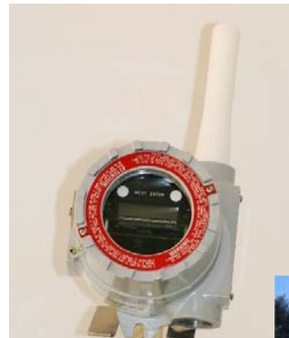
Base Radio Gateway in field mount enclosure with integral antenna. Rated XP Class 1 Div 2

These antennas provide considerably more range, and the Base Radio can be connected in conformance with Class 1 Div. 2 requirements when remote antennas are deployed in hazardous areas. Typical installation with remote antenna is to mount the Base Radio in or near the control room in an ordinary area with coax cable to an optional lightning arrester. An additional cable to the externally mounted high gain antenna provides maximum range for field unit communication. Mounting the antenna on a roof or other high unobstructed locations is the recommended installation practice.