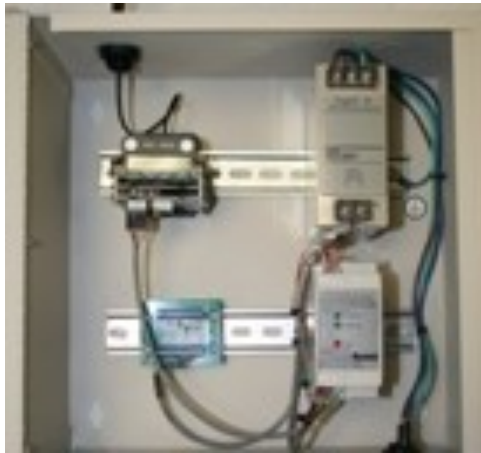
Base Radio Gateway DIN rail mounted with power supply and output module having 4 Analog signals and 8 Switches

When existing data management infrastructure favors the use of traditional 4-20 mA and contact closure outputs, the RS-485 data stream can be converted to analog and discrete values with DIN rail mounted modules.