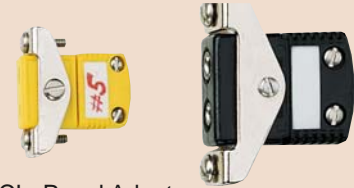
6ACL Panel Adaptor JACK NOT INCLUDED