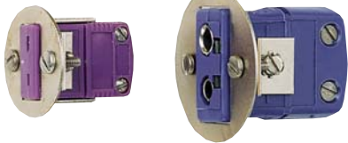
6RSC (standard) Round Single Circuit Panel Jack 6RMCR (mini)

Designed for mounting into an instrument case or control panel from the front. Fits in a standard 3/4" knockout (1 1/8" diameter). Polarity and color coded for identification.