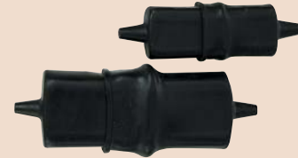
6WPB Standard Sized Plugs & Jack Flexible moisture proof boot for connector and wire connection.