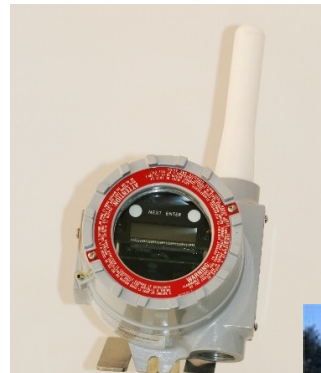
Base Radio Gateway in field mount enclosure with integral antenna. Rated XP Class 1 Div 2

These antennas provide considerably more range, and the Base Radio can be connected in conformance with Class 1 Div. 2 requirements when remote antennas are deployed in hazardous areas. Typical installation with remote antenna is to mount the Base Radio in or near the control room in an ordinary area with coax cable to an optional lightning arrester. An additional cable to the externally mounted high gain antenna provides maximum range for field unit communication. Mounting the antenna on a roof or other high unobstructed locations is the recommended installation practice.